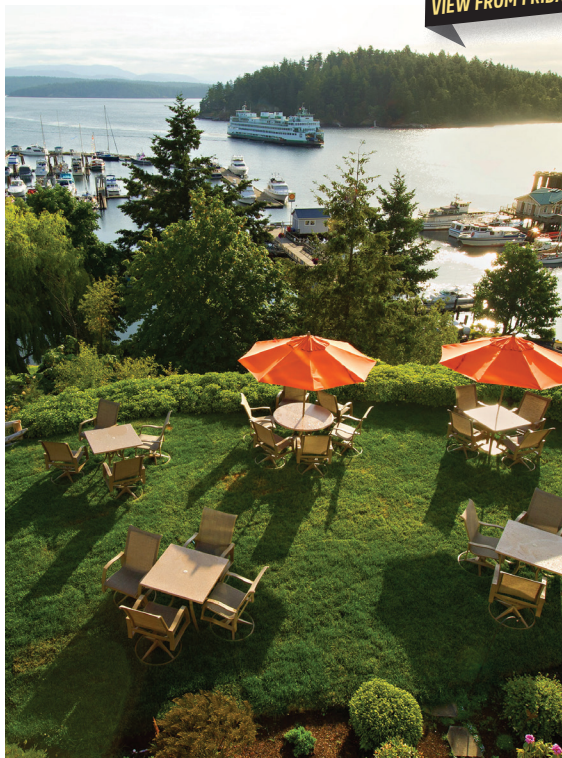
VIEW FROM FRIDAY HARBOR HOUSE