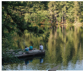
MORAN STATE PARK