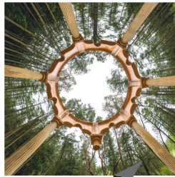
AFTERGLOW VISTA IN ROCHE HARBOR