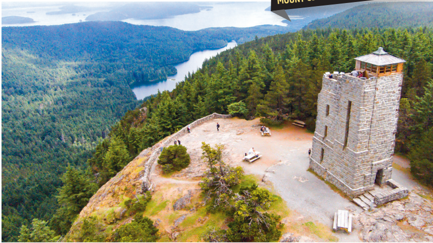
MOUNT CONSTITUTION OBSERVATION TOWER