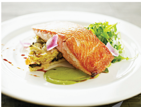
FRIDAY HARBOR HOUSE